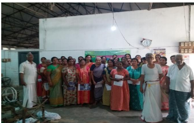
Members of Handloom Society at Chendamangalam