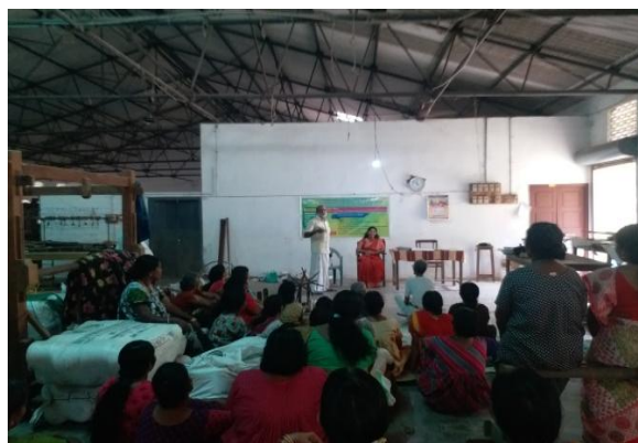
Handloom Society President addressing the members during the awareness programme