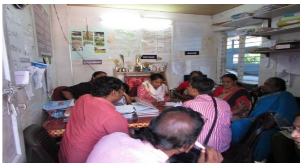
Interaction held with Kudumbhasree members

A visit was undertaken by RC officials to Chendamangalam village Weaver community during October 2016 to interact and understand the educational requirements and also promote the IGNOU Weaver Scheme. Interaction was held with the Panchayat Head, Kudumbhasree members and also visit was made to residence of handloom weavers.