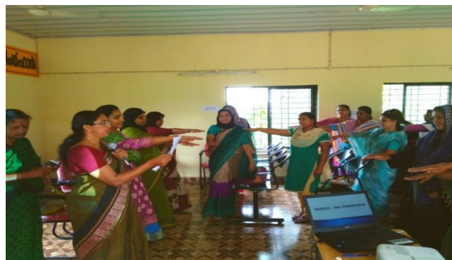
Pledge being administered to all participants as a part of Vigilance awareness week celebrations