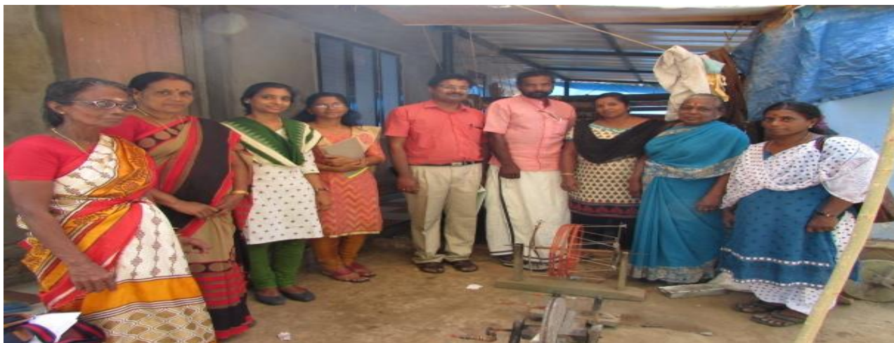
Kudumbhasree members, weavers and IGNOU RC officials during the visit