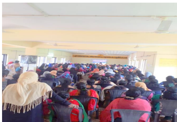
Kudumbashree Members during the Promotional Meeting at Edathala Panchayath