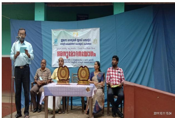
Principal of the Host Institution of LSC-14187 addressing the Students of St. Michael' s College, Cherthala