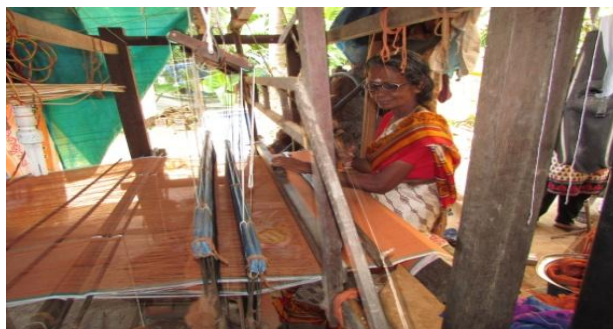
A weaver at Chendamangalam demonstrates her home based handloom