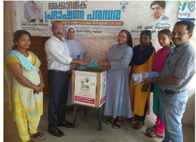
Students of PSC-14180P placing used clothes in the collection box for making cloth bag