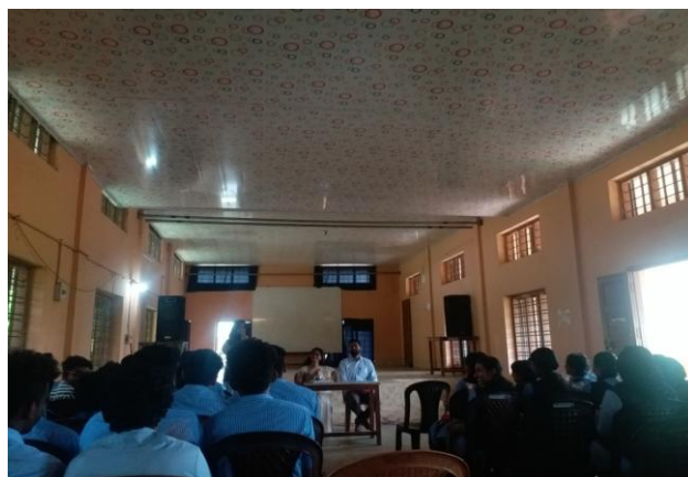
Students interacting during Plastic Free campaign at Edathala